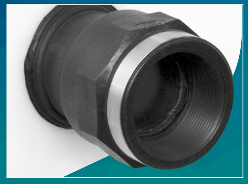
Connection pipe with 2" female thread

Many applications in process technology, swimming pool construction and fire-fighting water technology require large quantities of water in a short period of time; appropriately dimensioned flange connections ensure the right volume flows and and also ensure equalization between the tanks. The additional piping is laid without tension.