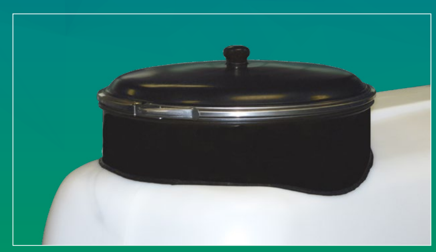
The tanks can be equipped with DN 600 access dome instead of DN 400.