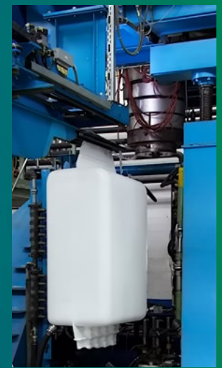
Blow molding system

The properties of thermoplastic products can be improved by off-line fluorination: The permeation of non-polar media (e.g. heating oil) is significantly reduced and the material's wettability (printing) increases considerably.