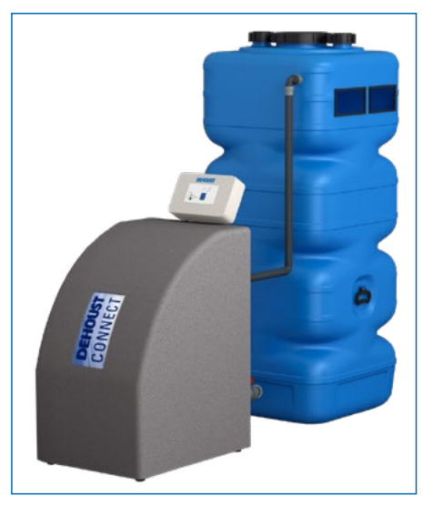
CONNECT separation station with large storage container and double pump