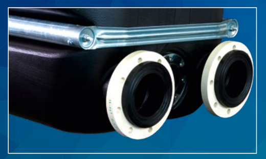
Double plastic flange made of PE with GRP loose flange

Individual solutions from large-scale production