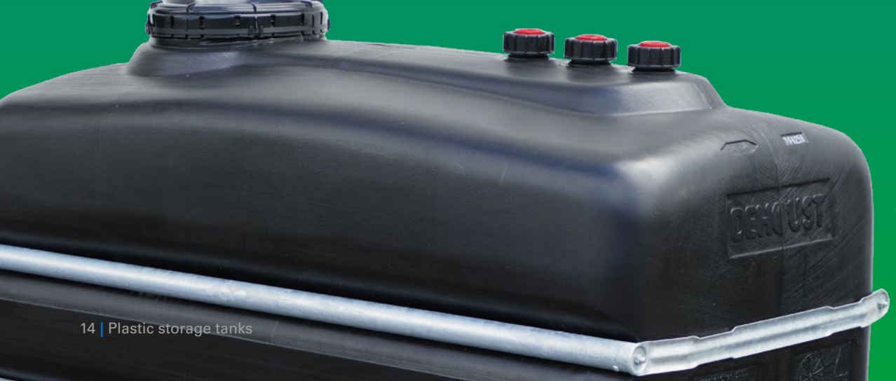
Containers for water-polluting liquids must not be fitted with additional connections.