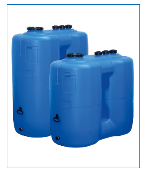
AQF 1100 and 1500