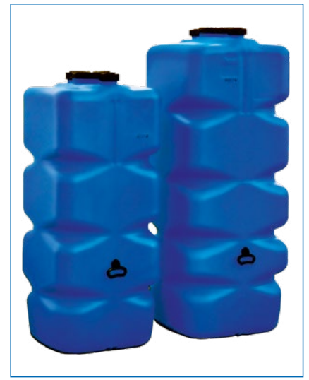
AQF 750 and 1000

The blue coloring makes them ideally suited for the storage of drinking water and process water. The formation of algae is prevented over the long term.