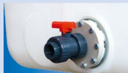
Flange with 1 1/2" tap