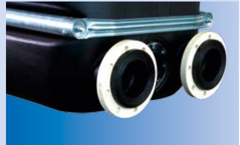
Dual PE plastic flange with GFK lapped flange

Lots of uses in process technology, in swimming pool construction and in fire water technology require major volumes of water in a short space of time; accordingly dimensioned flange connections ensure the right volume flow and the balancing of connected tanks. The interconnecting pipes are installed tension-free.