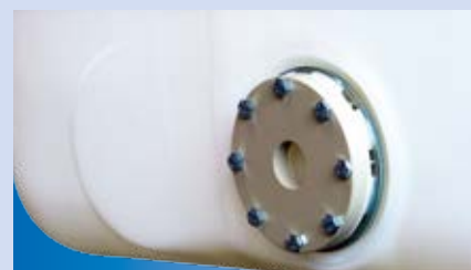
Steel and plastic connecting flange from 1" to 3"

The connecting flange (not a standard flange) can be drilled out to DN 70.