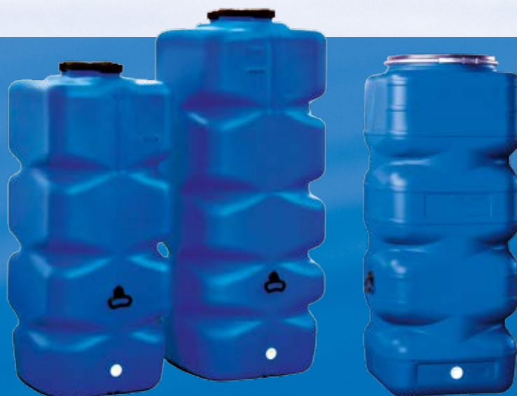
AQF 750 and 1000

The AQF in blue is ideal for storing drinking water and process water.