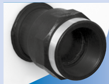
Connectors with 2" internal threads