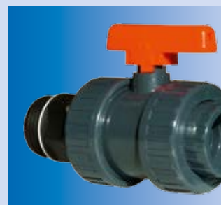
Stopcock - 1 1/2 inch with adaptor